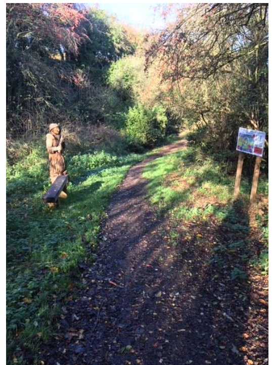
A view at the southern end of the Nature Reserve at Haxey