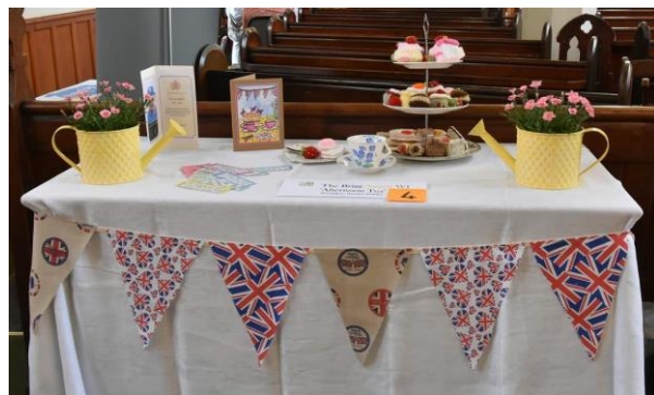
Shown above is the Brigg WI entry for the Festival, entitled 'Afternoon Tea'